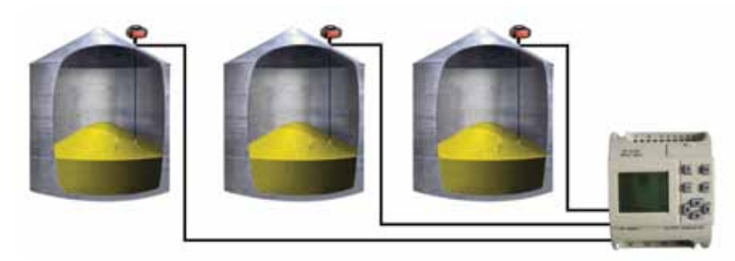
Each SmartBob AO requires a dedicated connection to the PLC.

The SmartBob AO with built-in 4-20 mA output can easily replace any 4-20 device by simply installing the SmartBob on the top of the bin and wiring the sensor to the existing 4-20 input. When the SmartBob AO measurement data is sent directly to a PLC, it eliminates the need for a C-100 or RSU control console or eBob software, as the programming interface and controls are built in to the SmartBob AO circuit board. There is one analog output per SmartBob, with this one-to-one relationship requiring a dedicated connection from each individual SmartBob AO to the PLC.